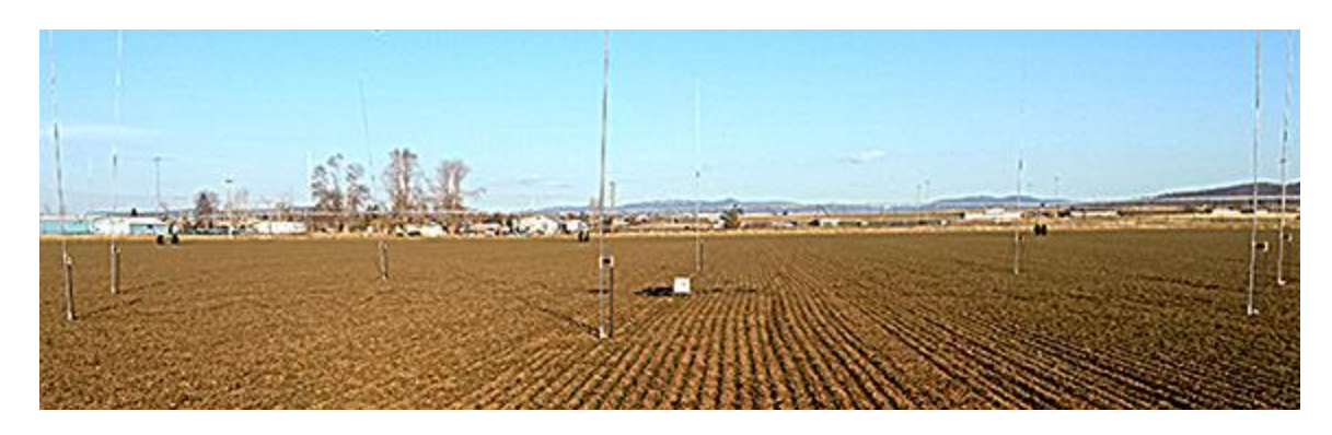
The HIZ-PC-8Pro array looking toward due West

The 8Pro phase controller is in a plastic box near the middle of the element layout. These element mounts are the same ones used at K7TJR since 2002. These are 19 feet 9 inches tall. There are many ways to construct or simply purchase elements as you will see in the following pages.