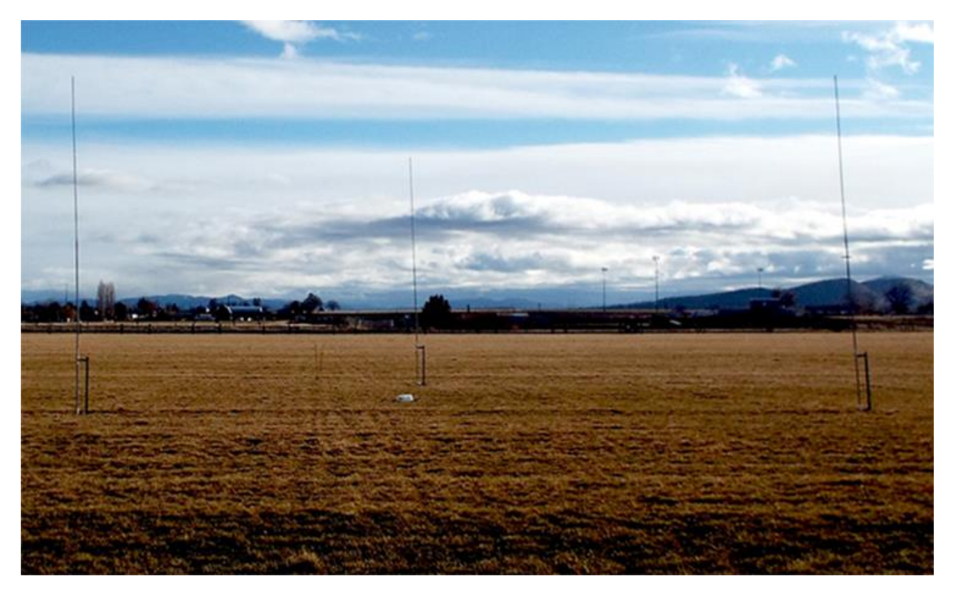
The Hi-Z 3A 3 element array looking toward a little South of due East

Normally these elements should be straight up and down however this picture was taken shortly after a heavy burst of wind. The 3A phase controller is in the plastic box near the middle of the element layout. These element mounts are the same ones used at K7TJR since 2002. These are 19 feet 9 inches tall. There are many ways to construct or simply purchase elements as you will see in the following pages.