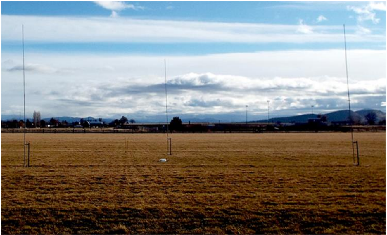
The Hi-Z 3A 3 element array looking toward a little South of due East

Normally these elements should be straight up and down however this picture was taken shortly after a heavy burst of wind. The 3A phase controller is in the plastic box near the middle of the element layout. These element mounts are the same ones used at K7TJR since 2002. These are 19 feet 9 inches tall. There are many ways to construct or simply purchase elements as you will see in the following pages.